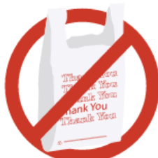
SINGLE-USE PLASTIC BAGS