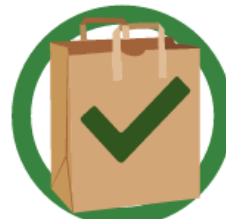
PAPER BAGS MADE FROM AT LEAST 40% POST-CONSUMER RECYCLED CONTENT