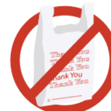
SINGLE-USE PLASTIC BAGS